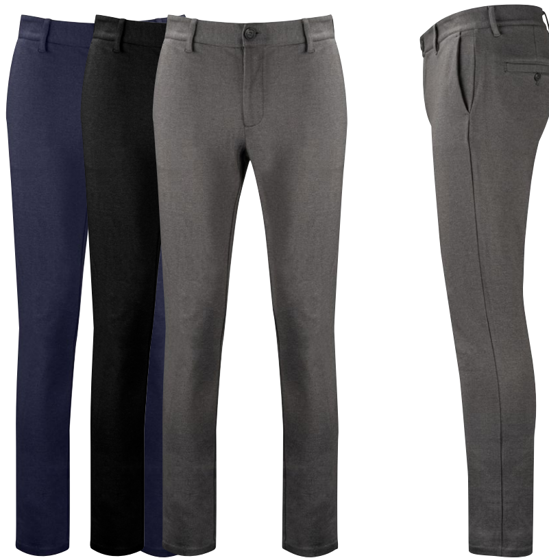
Dark navy 580

Size Men: 30/32-40/34 Size Women: XS-XXL