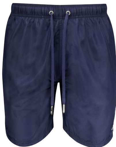
Dark navy 580