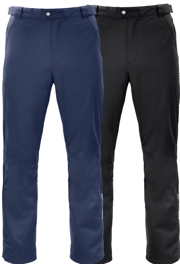
Dark navy 580