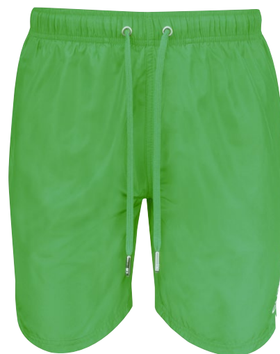
Lime green 608