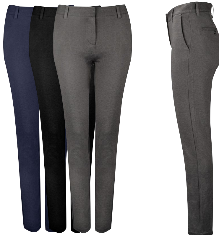
Dark navy 580