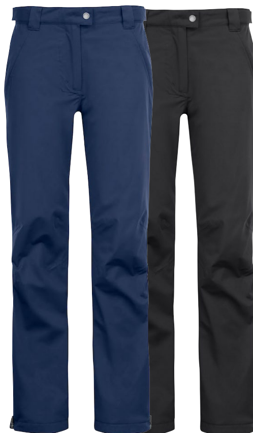
Dark navy 580