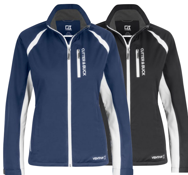
Dark navy 580