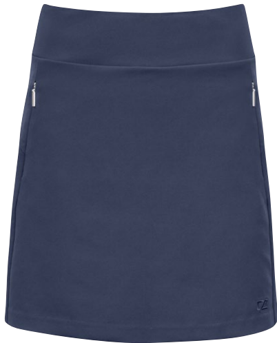
Dark navy 580

Fabric: Shell fabric: 86% polyester, 14% spandex. Inner shorts: 91% polyester, 9% spandex Weight: 225 g/m 2 | 839:-/10 pcs Size Women: XS-XXL