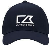
Dark navy 580