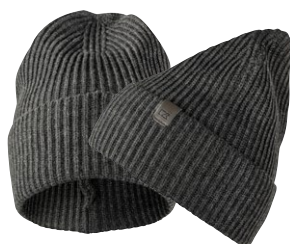
Anthracite melange 955