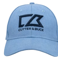
Polar blue 593