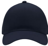
Dark navy 580