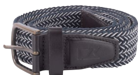
Dark navy 580