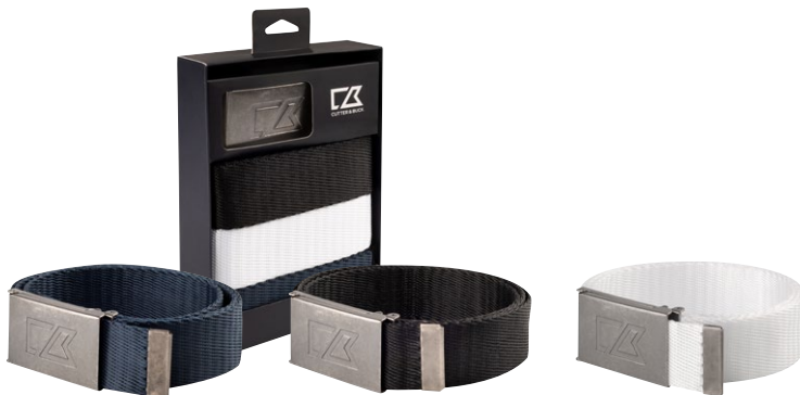
Dark navy 580